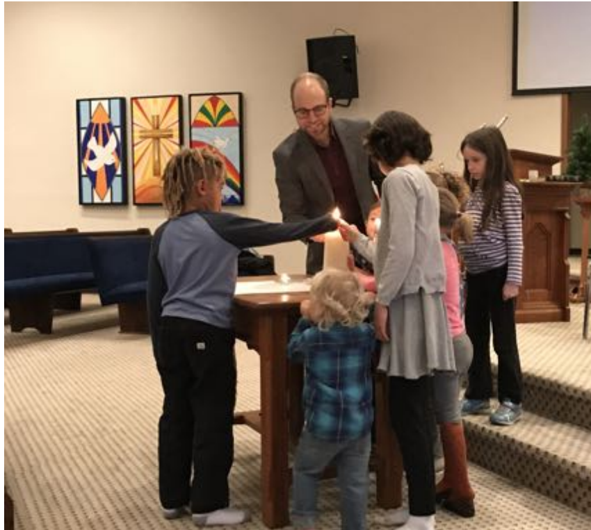
Child Within Sunday, Lighting the Christ Candle