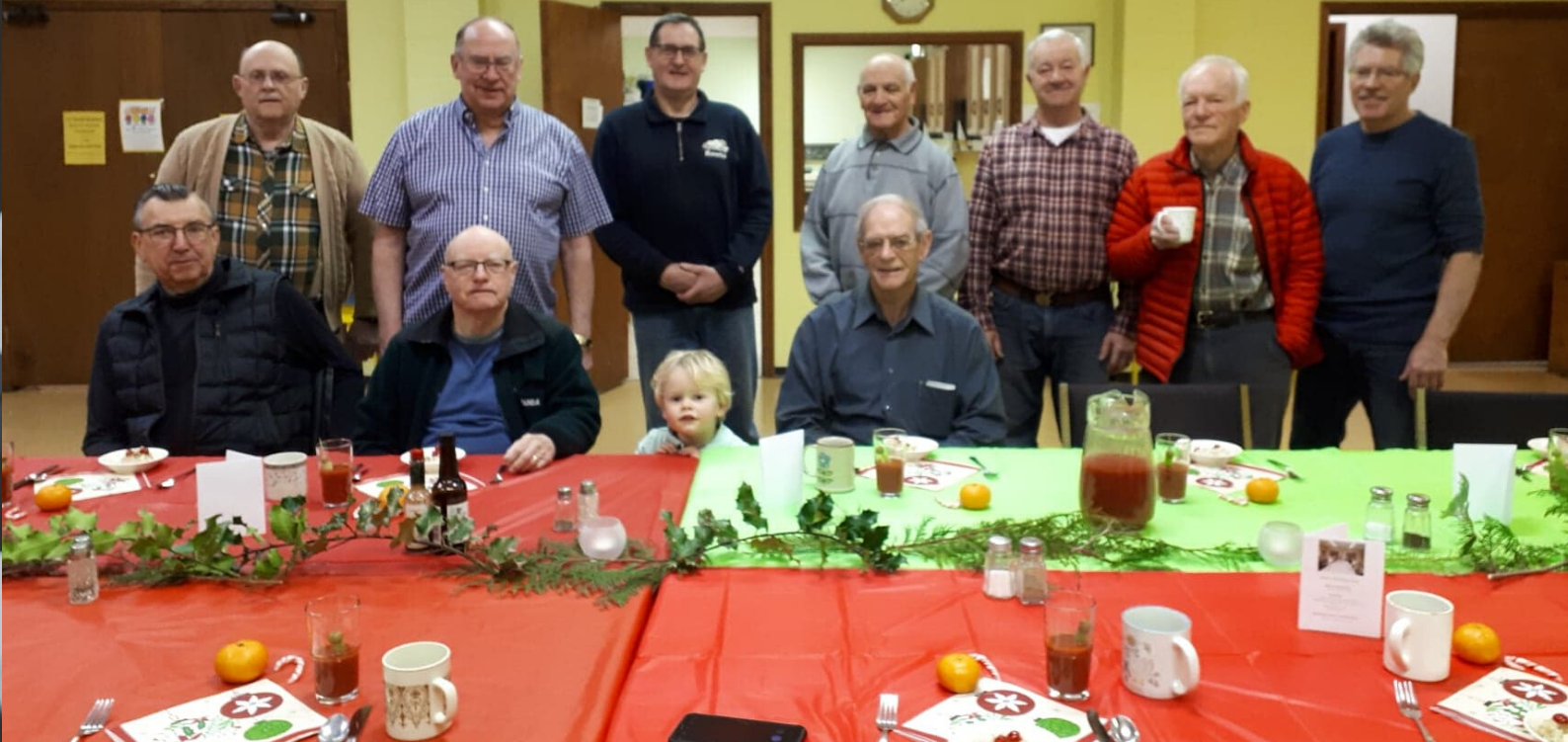
Men's breakfast celebrated Advent and Christmas with a fine morning feast