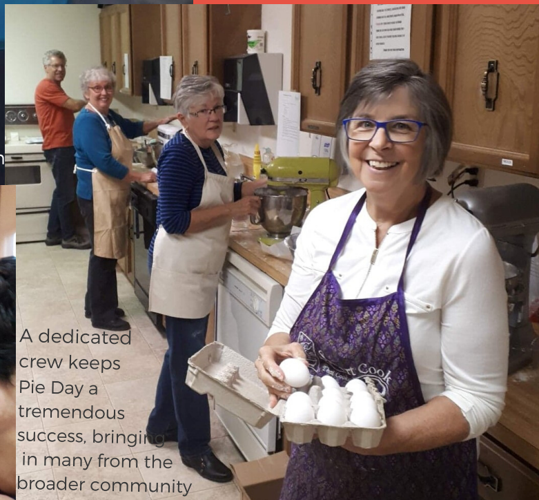
A dedicated crew keeps Pie Day a tremendous success, bringing in many from the broader community