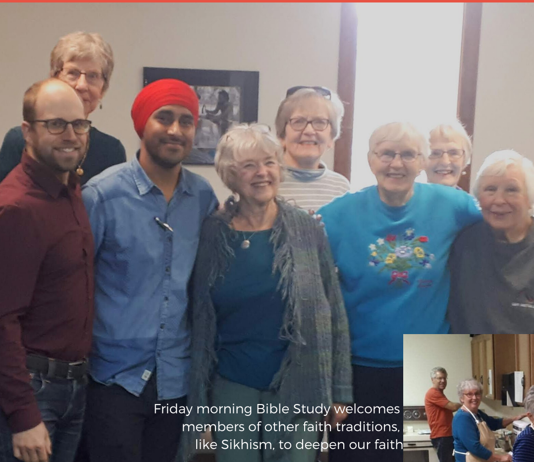
Friday morning Bible Study welcomes members of other faith traditions, like Sikhism, to deepen our faith