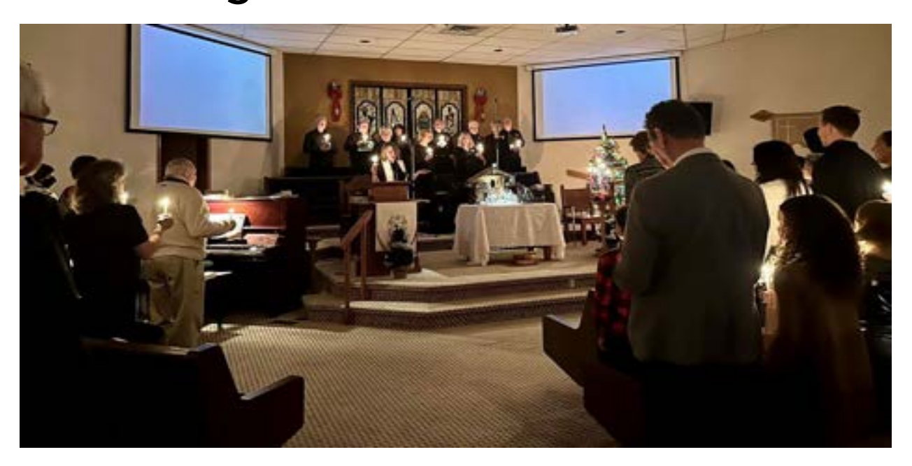
Living, loving and leading in the Light of God